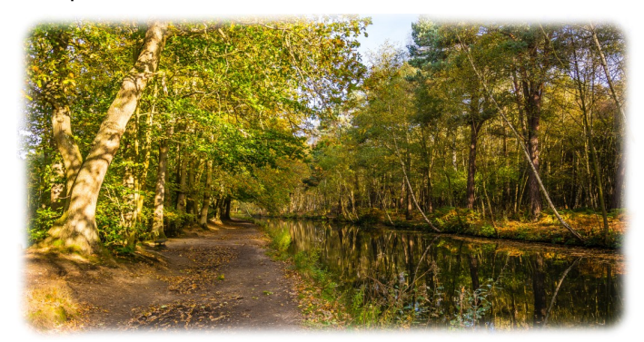
Basingstoke Canal close to Tom's Halt.

Frimley Lodge Park is a 60 acre site owned and managed by Surrey Heath Borough Council. In addition to Frimley Lodge Miniature Railway, the park boasts a range of facilities for all ages and hosts events for all the family. There are lots of open spaces and woodland, picnic areas, two children's playgrounds, a trim trail and meadows. In addition there are football and cricket pitches and a pitch and putt course.