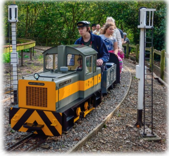
7¼ inch gauge narrow gauge diesel 0-6-0 Harlech Castle .