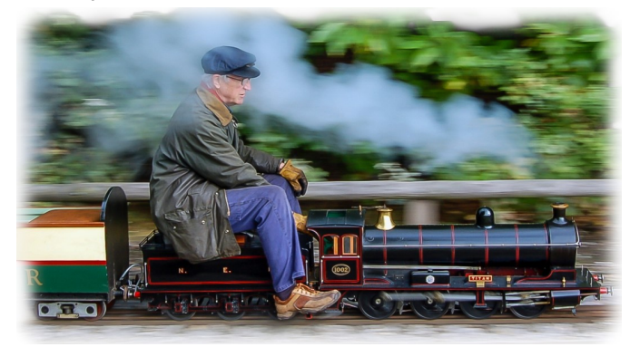
71/4 inch gauge NER T1 Class 0-8-0 Titan.

Pictured below are a selection of locomotives that are likely to be seen on a visit to Frimley Lodge Miniature Railway.