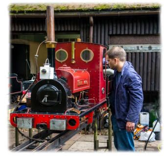
7¼ inch gauge Hunslet narrow gauge saddle tank 0-4-0 Nellie Madora.